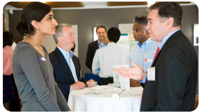
PHOTO FROM Past HIP Student Networking Night

HIP plans to host a student networking night this upcoming school year. All students interested in speaking with a variety of professionals in the health sector are invited to attend. This event is an opportunity for students to make valuable connections and to hear first hand the career paths professionals have taken. HIP will publish more details on the event during this upcoming semester.