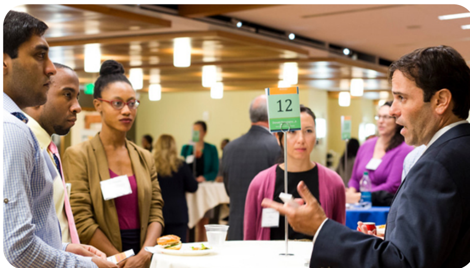
PHOTO FROM Past HIP Student Networking Night